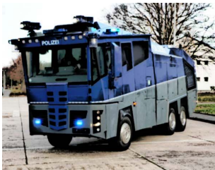
Police water cannons latest design

The NATO-Report writes: The electric shock can result in burns and have a pacemaker put out of operation.