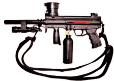
Pepper Ball Gun

The NATO-Report writes: The shot-filled bags to fit the contour of the wounded and therefore cause less severe injuries than hard projectiles. Depending on weight and distance, such weapons may have undesirable injury such as severe bruises, broken bones, concussion and eye damage. They can also be fatal.