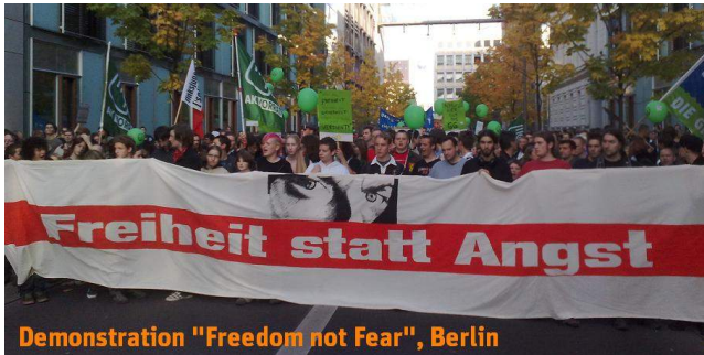
Demonstration "Freedom not Fear", Berlin

Data retention violates the human right on privacy und informational self-determination and deeply violates the secrecy of telecommunication as laid out in article 10 of the German Constitution. It affects professional activities which rely on confideliity (health care, church, justice, journalism) but also political activism and business. It further violates the principle of presumption of innocence and is of little use as it can be circumvented easily by criminals. Furthermore it is expensive and is a burden to economy and consumers alike.